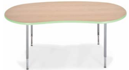
Planner Contour Activity Table

Model 25650. Shown in Grey Mesh top with Persian Blue edge and Platinum frame.