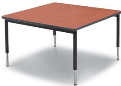
Planner Square Activity Table

Model 25660. Shown in Tan Echo top with Mint edge and Platinum frame.