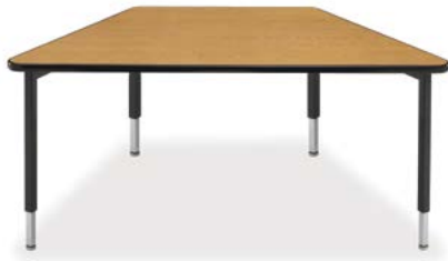
Planner Trapezoid Activity Table

Model 25600. Shown in Golden Oak top with Black edge and Black frame.