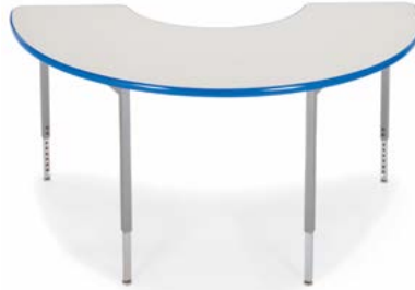
Planner Half Moon Activity Table

Model 25600. Shown in Golden Oak top with Black edge and Black frame.