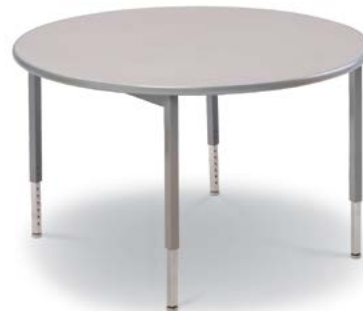
Planner Round Activity Table

Model 25610. Shown in Wild Cherry top with Black edge and Black frame.