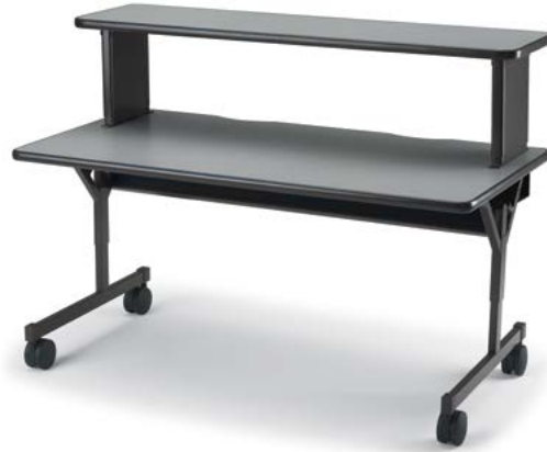
Model 17649. Shown in Grey Nebula with Black edge and Black frame.