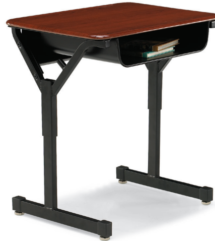
model #01362 (20"x27") single-student hard-plastic flex desk shown in Cherry/Black with optional steel bookbox #17190.

The FRAME is attached to the pre-drilled holes in the top with (12) #10 x 3/4" screws through a 3"W x 18"L 14-gauge steel mounting plate. The mounting plate is welded to (2) 1" square 16-gauge steel Y-shaped tubes which are welded to a 1 1/4" x 2" 14-gauge vertical leg support. The legs adjust in height from 19" to 31" in 1" increments. The adjustment for each leg is secured with (2) 3 3/4" -16 x .675 allen screws. All open ends on the 16-gauge tubing will be capped with color matched plastic end caps. The bases have a color matched lockable end cap/glide combination that resists tampering. The right and left leg both include Smith System patented backpack peg allowing for either inside or outside positioning. The legs are tied together for added strength with a 1" x 2" 14-gauge steel crossbar that supplies a rigid, long lasting piece of furniture.