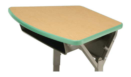
Arc-8 Student Desk, Model 01351. Shown with optional Steel Bookbox, Model #17016