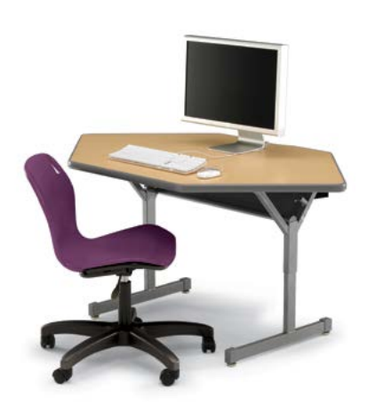
Model 01379. Shown in Maple top with Platinum edge and Platinum frame.