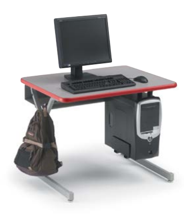
Model 01383. Shown in Grey Nebula top with Red edge and Platinum frame. Shown with optional CPU Holder, Model 17213.