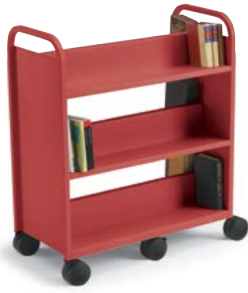
GORILLA TRUCK™ - SIX SLOPING SHELVES MODEL #21101