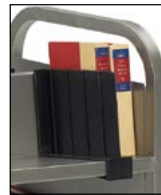
DIVIDERS FOR BOOKTRUCKS MODEL #21104 ( APPLY TO #21001-#21031 ) MODEL #21105 ( APPLY TO #21092-21096 )