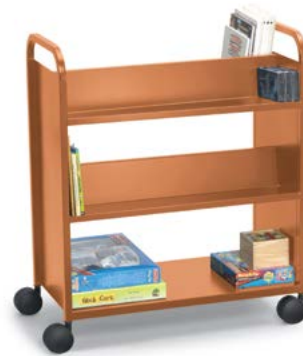
FOUR SLOPING, BOTTOM FLAT SHELF TRUCK MODEL #21021