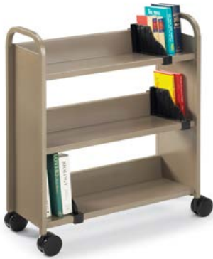
THREE SLOPING SHELF BOOKTRUCK MODEL #21092 MODEL #21094 (INCLUDES 3 BOOK SUPPORTS)