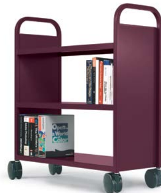
THREE FLAT SHELF BOOKTRUCK MODEL #21051