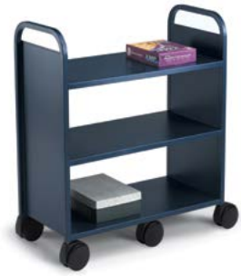
GORILLA TRUCK™ - THREE FLAT SHELVES MODEL #21103