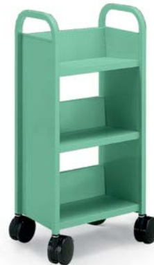
THREE SLOPING SHELF BOOKTRUCK MODEL #21096