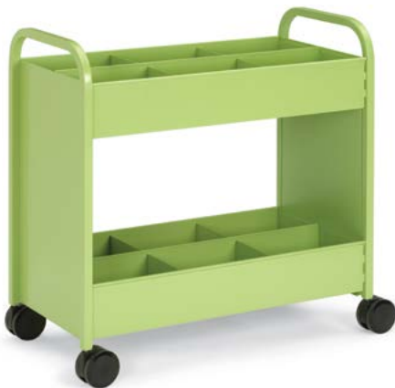
EVERYTHING CART™ MODEL #21088