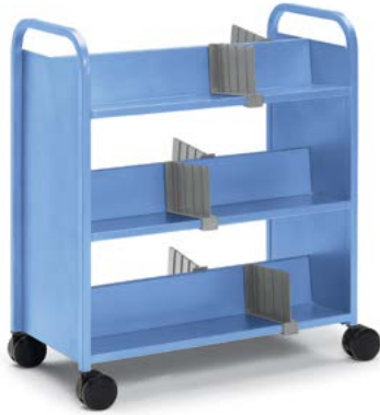
SIX SLOPING SHELF BOOKTRUCK MODEL #21001 MODEL #21004 (INCLUDES 6 BOOK SUPPORTS)