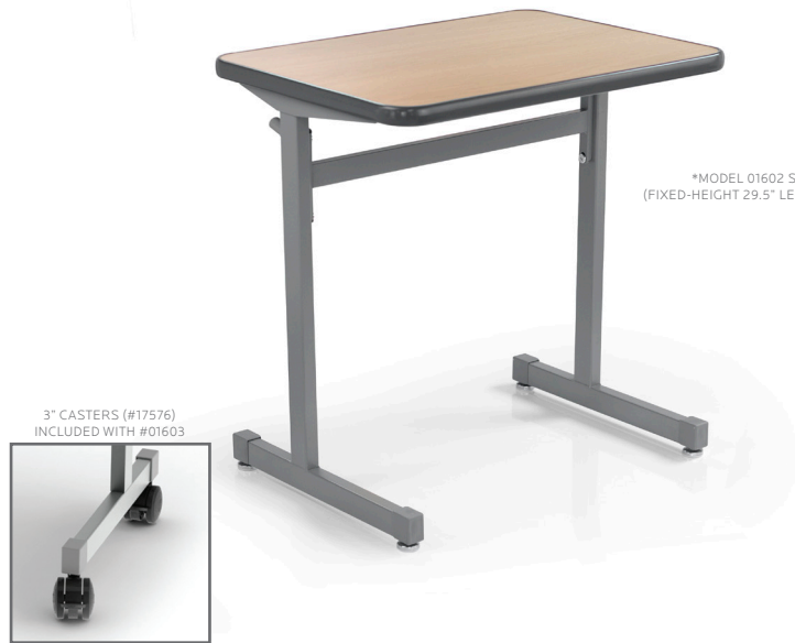
*MODEL 01602 SHOWN (FIXED-HEIGHT 29.5" LEG WITH GLIDE)