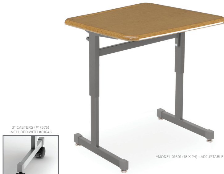
3" CASTERS (#17576) INCLUDED WITH #01646