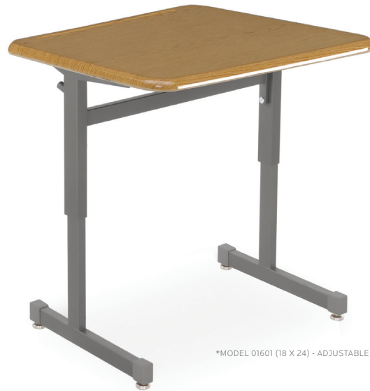
*MODEL 01601 (18 X 24) - ADJUSTABLE 19"-31" SHOWN.