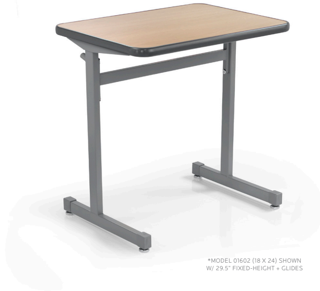
*MODEL 01602 (18 X 24) SHOWN W/ 29.5" FIXED-HEIGHT + GLIDES