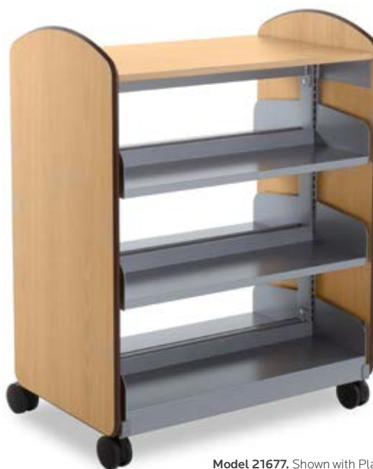
Model 21677. Shown with Platinum frame, Maple top and radius end panels in Chocolate.