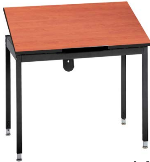
One-Piece Slope-Top Graphic Arts Table, Model 27347. Shown in Golden Oak top with Golden Oak edge and Champagne frame.