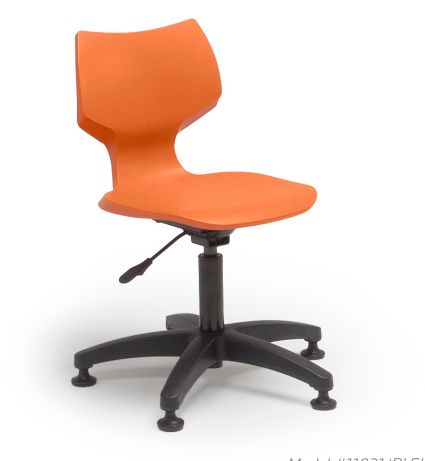
Model #11831 'B' Shell w/ glides shown.