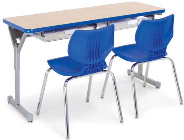
model #01361 20" x 60" two-student flex desk shown, with optional Cascade Storage tote tray w/ housing model #30926

The FRAME is attached to the pre-drilled holes in the top with (12) #10 x 3/4" screws through a 3"W x 18"L 14-gauge steel mounting plate. The mounting plate is welded to (2) 1" square 16-gauge steel Y-shaped tubes which are welded to a 1 1/4" x 2" 14-gauge vertical leg support. The legs adjust in height from 24" to 32" in 1" increments. The adjustment for each leg is secured with (2) 3/4" -16 x .675 allen screws. All open ends on the 16-gauge tubing will be capped with color matched plastic end caps. The bases have a color matched lockable end cap/glide combination that resists tampering. The right and left leg both include Smith System patented backpack peg allowing for either inside or outside positioning. The legs are tied together for added strength with a 1" x 2" 14-gauge steel crossbar that supplies a rigid, long lasting piece of furniture.