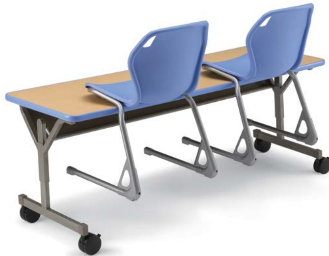
model #01359 (24"x72") shown with optional 4" caster #17554 with 18" Intuit Sled Base chairs model #00519

The FRAME is attached to the pre-drilled holes in the top with (12) #10 x 3/4" screws through a 3"W x 18"L 14-gauge steel mounting plate. The mounting plate is welded to (2) 1" square 16-gauge steel Y-shaped tubes which are welded to a 1 1/4" x 2" 14-gauge vertical leg support. The legs adjust in height from 24" to 32" in 1" increments. The adjustment for each leg is secured with (2) 3/4" -16 x .675 allen screws. All open ends on the 16-gauge tubing will be capped with color matched plastic end caps. The bases have a color matched lockable end cap/glide combination that resists tampering. The right and left leg both include Smith System patented backpack peg allowing for either inside or outside positioning. The legs are tied together for added strength with a 1" x 2" 14-gauge steel crossbar that supplies a rigid, long lasting piece of furniture.