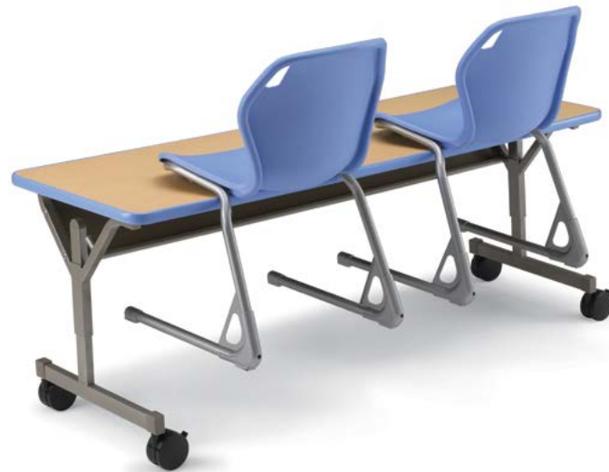
model #01359 (24"x72") shown with optional 4" caster #17554 with 18" Intuit Sled Base chairs model #00519

The FRAME is attached to the pre-drilled holes in the top with (12) #10 x 3/4" screws through a 3"W x 18"L 14-gauge steel mounting plate. The mounting plate is welded to (2) 1" square 16-gauge steel Y-shaped tubes which are welded to a 1 1/4" x 2" 14-gauge vertical leg support. The legs adjust in height from 24" to 32" in 1" increments. The adjustment for each leg is secured with (2) 3/4" -16 x .675 allen screws. All open ends on the 16-gauge tubing will be capped with color matched plastic end caps. The bases have a color matched lockable end cap/glide combination that resists tampering. The right and left leg both include Smith System patented backpack peg allowing for either inside or outside positioning. The legs are tied together for added strength with a 1" x 2" 14-gauge steel crossbar that supplies a rigid, long lasting piece of furniture.