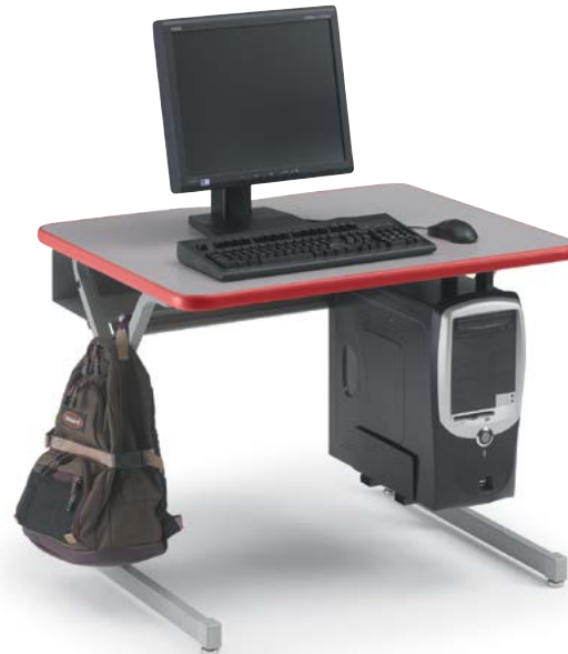
model #01383 (30"x36") single-student flex station shown, with optional CPU holder #17213