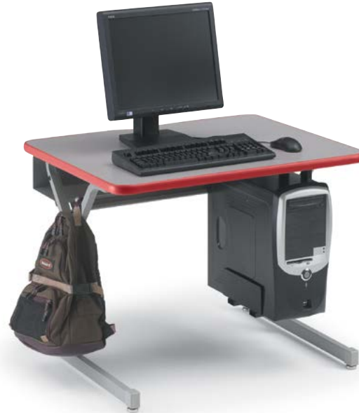
model #01383 (30"x36") single-student flex station shown, with optional CPU holder #17213