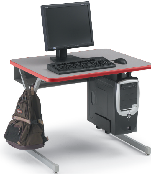
model #01383 (30"x36") single-student flex station shown, with optional CPU holder #17213