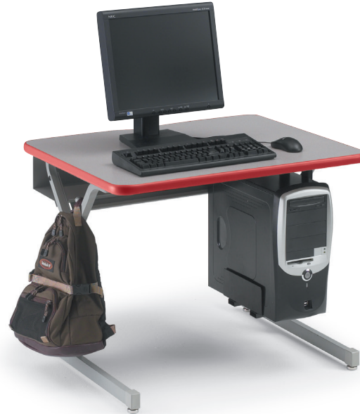
model #01383 (30"x36") single-student flex station shown, with optional CPU holder #17213