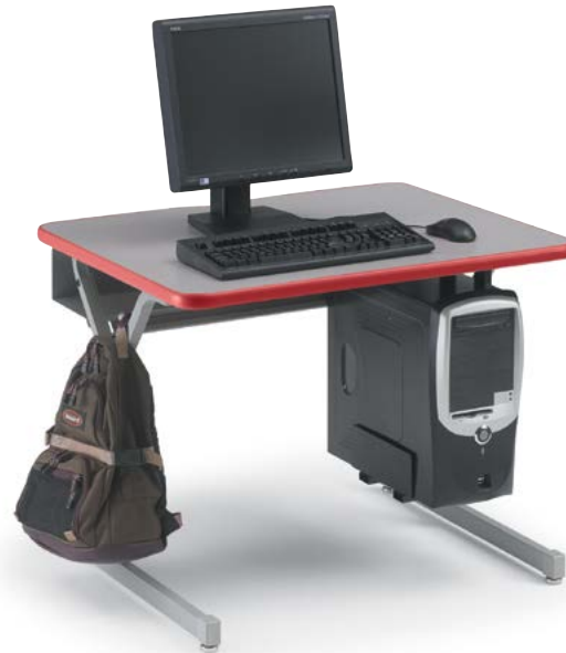
model #01383 (30"x36") single-student flex station shown, with optional CPU holder #17213