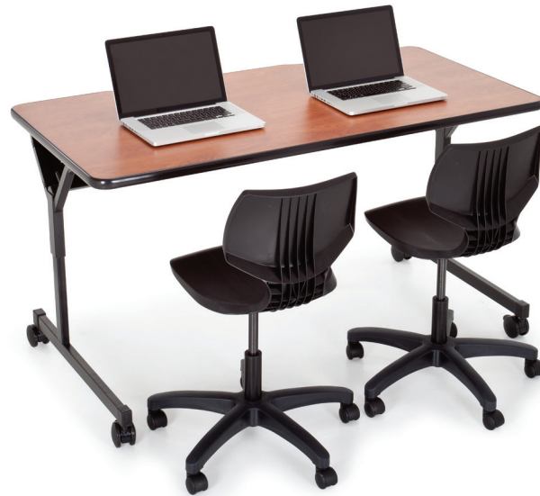
model #01386 (30"x 60") two-student flex station shown, with optional monitor mounts #17350 and optional 3" caster pack #17576