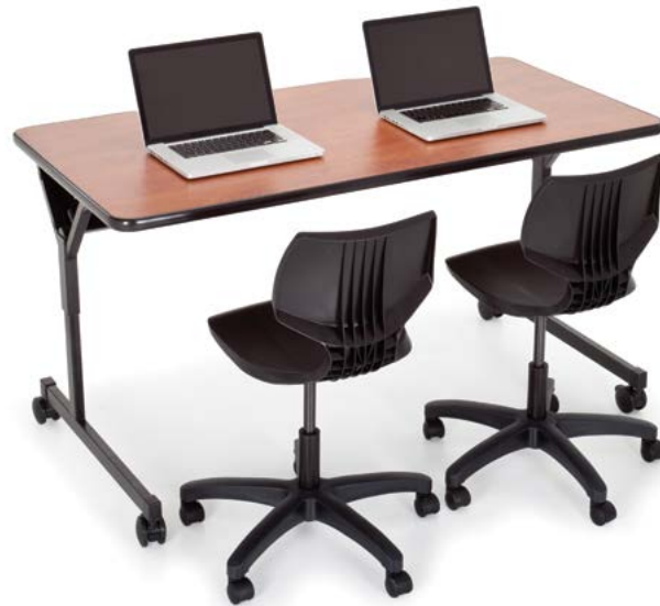
model #01386 (30"x 60") two-student flex station shown, with optional monitor mounts #17350 and optional 3" caster pack #17576