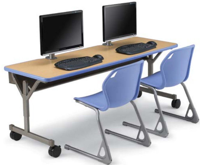
model #01378 (24"x72") two-student flex station shown, with optional monitor mounts #17350 and optional 4" caster pack #17554