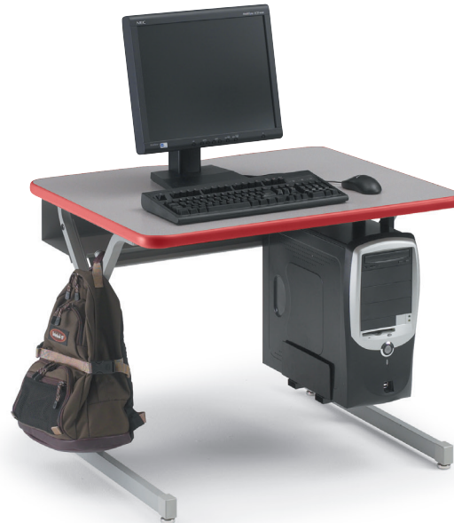
model #01383 (30"x36") single-student flex station shown, with optional CPU holder #17213