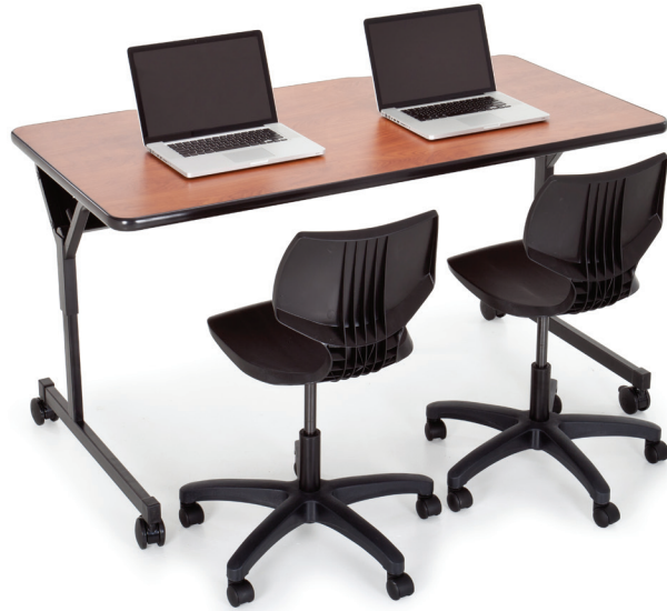
model #01386 (30" x 60") two-student flex station shown, with optional monitor mounts #17350 and optional 3" caster pack #17576