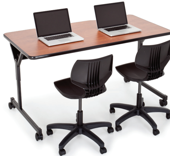
model #01386 (30"x 60") two-student flex station shown, with optional monitor mounts #17350 and optional 3" caster pack #17576