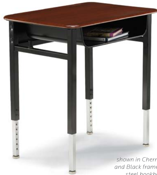
shown in Cherry hard plastic and Black frame with optional steel bookbox #17190

The FRAME is attached to the pre-drilled holes in the top with (12) #10 x 5/8" screws through a 3 1/8"W x 18"L 14-gauge steel mounting plate. The mounting plate is welded to (2) 1 1/4" square 14-gauge steel tube legs which is welded to a 1" square 14-gauge steel tube and adjust in height from 22" to 32" in 1" increments. The adjustment for each leg is secured with (2) 3 3/4" -16 x .675" Allen screws. The right and left leg both include the Smith System patented backpack peg allowing for either inside or outside positioning. The legs are tied together for added strength with a 6" high 18-gauge steel panel and (4) Connector Bolts. Legs have 1" adjusting leveling glides.