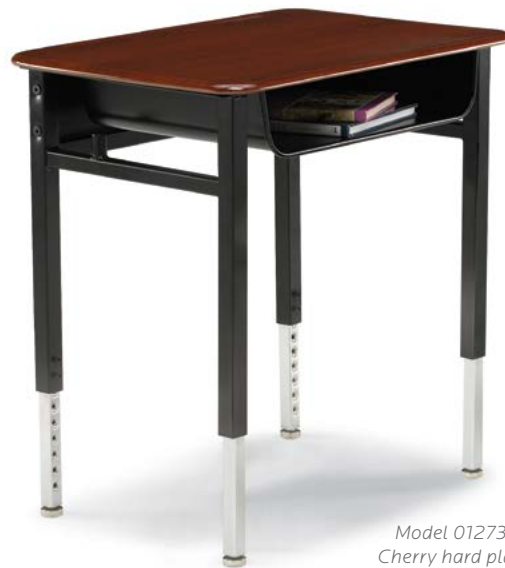
Model 01273 20" x 27" shown in Cherry hard plastic and Black frame with optional steel bookbox #17190

The FRAME is attached to the pre-drilled holes in the top with (12) #10 x 5/8" screws through a 3 1/8"W x 18"L 14-gauge steel mounting plate. The mounting plate is welded to (2) 1 1/4" square 14-gauge steel tube legs which is welded to a 1" square 14-gauge steel tube and adjust in height from 22" to 32" in 1" increments. The adjustment for each leg is secured with (2) 3 3/4" -16 x .675" Allen screws. The right and left leg both include the Smith System patented backpack peg allowing for either inside or outside positioning. The legs are tied together for added strength with a 6" high 18-gauge steel panel and (4) Connector Bolts. Legs have 1" adjusting leveling glides.