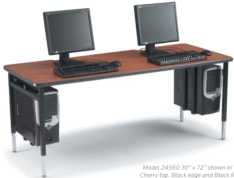
Model 24560 30" x 72" shown in Wild Cherry top, Black edge and Black frame. +Optional CPU Holders #17213.