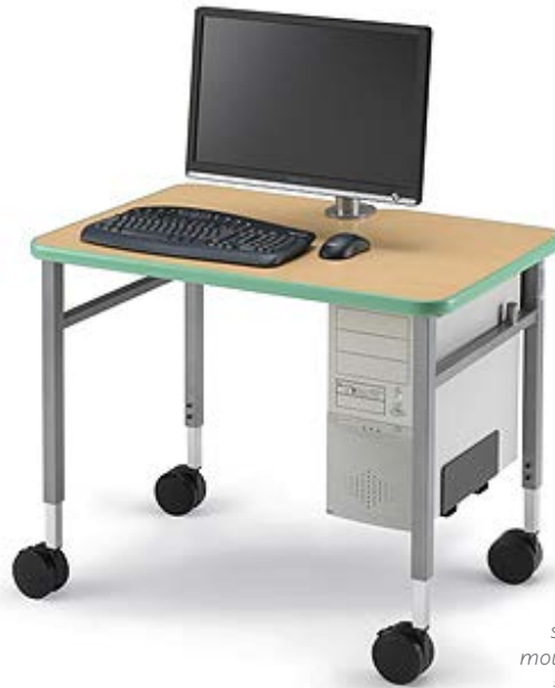
shown with optional monitor mount model #17350, CPU Holder #17213 & 4" casters #17554

WIRE MANAGEMENT includes a 3"d x 6"h wire tray mounted to the underside of the work surface with #10 x 3/4" screws. The tray also mounts to each leg using a total of 4 Connector bolts. Wire trays for tables under 60" wide have one grommet hole for wire management, 60" and wider have two grommet holes.