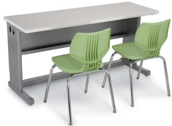
Model 26283. Shown in Grey Mesh with White edge and Platinum frame. Shown with optional Flavors Stack Chair in Apple, Model 11849.