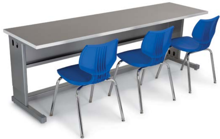
Model 26285. Shown in Pewter Mesh with White edge and Platinum frame. Shown with optional Flavors Stack Chair in Persian Blue, Model 11849.