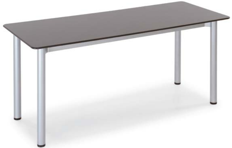
Model XT2454GRYPLTFL. Shown with Grey Trespa™ TopLab™ Plus top.