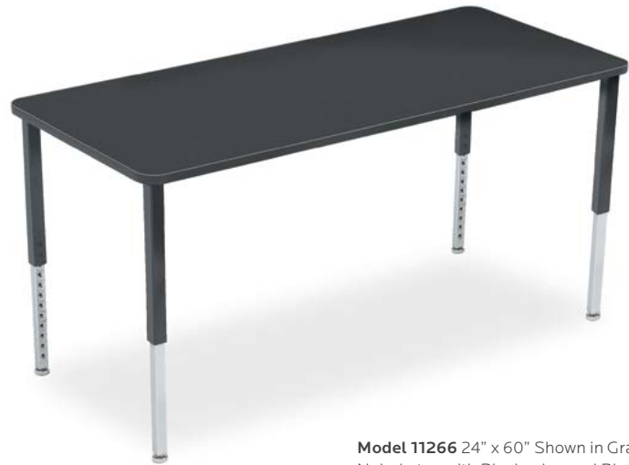
Model 11266 24" x 60" Shown in Graphite Nebula top with Black edge and Black frame.

The FRAME consists of two fully welded leg segments and a center support channel. The legs are attached to the pre-drilled holes in the top with (16) #10 x 5/8" wood screws through a 3 1/8" w x 18"L 12-gauge steel mounting plate. The mounting plate is welded to (2) 1 1/4" square 12-gauge steel tube legs which is welded to a 1" x 2" 14-gauge steel tube cross bar. The leg inserts are 1" square 14-gauge steel tube and adjust in height from 24" to 34" in 1" increments. Leveling glides are on each table leg allowing for stability on uneven floors. The adjustment for each leg is secured with (2) 3 3/4" -16 x .675" Allen screws. The center support channel is 2" x 3" 14-gauge steel, with 11-gauge steel end plates for maximum stability. The center support channel is connected to the legs by (4) connector bolts.