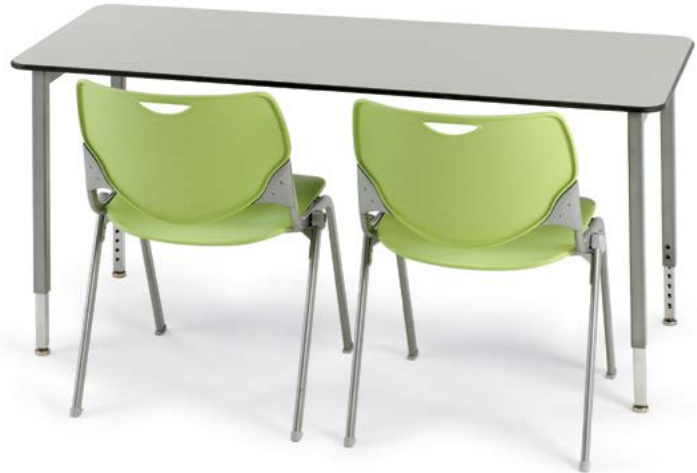
Model 11268 24" x 60" shown with Grey Trespa™ TopLab™ Plus top and Platinum frame.

The FRAME consists of two fully welded leg segments and a center support channel. The legs are attached to the pre-drilled holes in the top with #10 x 7/16" plastite screws. (Using low drill setting 75% power), through a 3 1/8" w x 18" L 12-gauge steel mounting plate. The mounting plate is welded to (2) 1 1/4" square 12-gauge steel tube legs which is welded to a 1" x 2" 14-gauge steel tube cross bar. The leg inserts are 1" square 14-gauge steel tube and adjust in height from 24" to 34" in 1" increments. Leveling glides are on each table leg allowing for stability on uneven floors. The adjustment for each leg is secured with (2) 3 3/4" -16 x .675" Allen screws. The center support channel is 2" x 3" 14-gauge steel, with 11-gauge steel end plates for maximum stability. The center support channel is connected to the legs by (4) connector bolts.