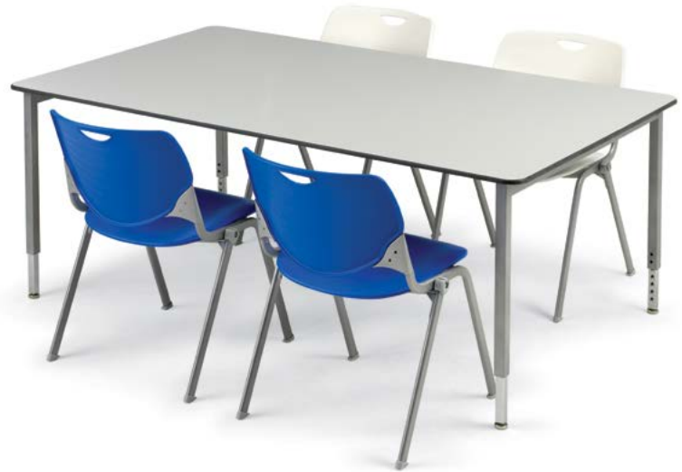
Model 25715 42" x 72" shown with Grey Trespa™ TopLab™ Plus top and Platinum frame.

The FRAME consists of two fully welded leg segments and a center support channel. The legs are attached to the pre-drilled holes in the top with #10 x 7/16" plastite screws. (Using low drill setting 75% power), through a 3 1/8" w x 18" L 12-gauge steel mounting plate. The mounting plate is welded to (2) 1 1/4" square 12-gauge steel tube legs which is welded to a 1" x 2" 14-gauge steel tube cross bar. The leg inserts are 1" square 14-gauge steel tube and adjust in height from 24" to 34" in 1" increments. Leveling glides are on each table leg allowing for stability on uneven floors. The adjustment for each leg is secured with (2) 3 3/4" -16 x .675" Allen screws. The center support channel is 2" x 3" 14-gauge steel, with 11-gauge steel end plates for maximum stability. The center support channel is connected to the legs by (4) connector bolts.