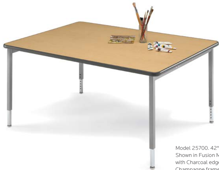
Model 25700. 42"d x 60"w. Shown in Fusion Maple top with Charcoal edge and Champagne frame.