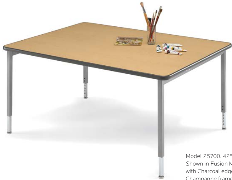
Model 25700. 42"d x 60"w. Shown in Fusion Maple top with Charcoal edge and Champagne frame.

The frame consists of two fully welded leg segments and a center support channel. The legs are attached to the pre-drilled holes in the top with (16) #10 x 5/8" wood screws through a 3 1/8" w x 18"L 12-gauge steel mounting plate. The mounting plate is welded to (2) 1 1/4" square 12-gauge steel tube legs which is welded to a 1" x 2" 14-gauge steel tube cross bar. The leg inserts are 1" square 14-gauge steel tube and adjust in height from 24" to 34" in 1" increments. Leveling glides are on each table leg allowing for stability on uneven floors. The adjustment for each leg is secured with (2) 3 3/4" -16 x .675" Allen screws. The 2 center support channels are 2" x 3" 14-gauge steel, with 11-gauge steel end plates for maximum stability. The 2 center support channels are connected to the legs by (8) connector bolts.