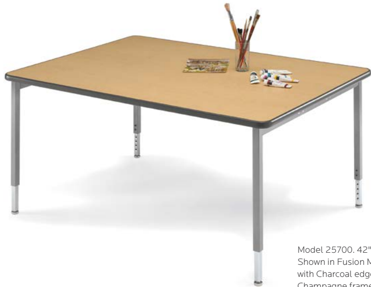
Model 25700. 42"d x 60"w. Shown in Fusion Maple top with Charcoal edge and Champagne frame.

The frame consists of two fully welded leg segments and a center support channel. The legs are attached to the pre-drilled holes in the top with (16) #10 x 5/8" wood screws through a 3 1/8" w x 18"L 12-gauge steel mounting plate. The mounting plate is welded to (2) 1 1/4" square 12-gauge steel tube legs which is welded to a 1" x 2" 14-gauge steel tube cross bar. The leg inserts are 1" square 14-gauge steel tube and adjust in height from 24" to 34" in 1" increments. Leveling glides are on each table leg allowing for stability on uneven floors. The adjustment for each leg is secured with (2) 3 3/4" -16 x .675" Allen screws. The 2 center support channels are 2" x 3" 14-gauge steel, with 11-gauge steel end plates for maximum stability. The 2 center support channels are connected to the legs by (8) connector bolts.