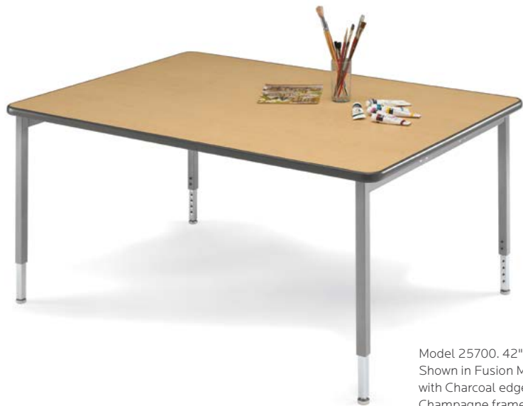
Model 25700. 42"d x 60"w. Shown in Fusion Maple top with Charcoal edge and Champagne frame.