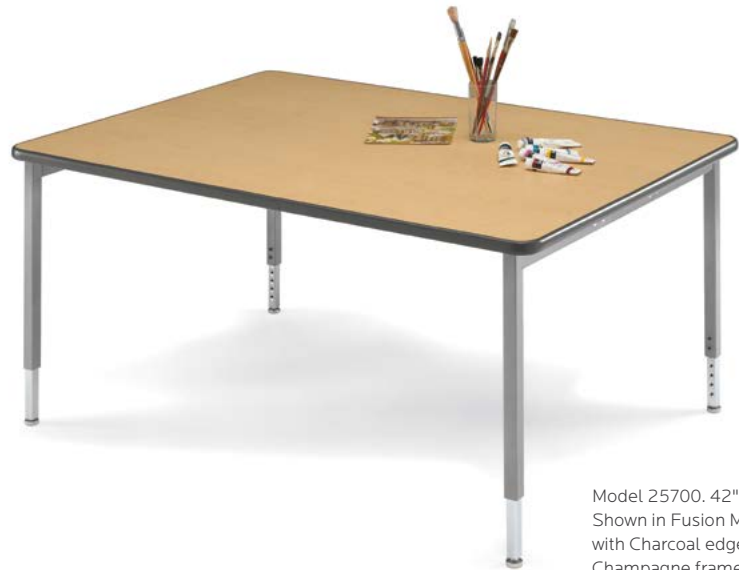
Model 25700. 42"d x 60"w. Shown in Fusion Maple top with Charcoal edge and Champagne frame.

The frame consists of two fully welded leg segments and a center support channel. The legs are attached to the pre-drilled holes in the top with (16) #10 x 5/8" wood screws through a 3 1/8" w x 18"L 12-gauge steel mounting plate. The mounting plate is welded to (2) 1 1/4" square 12-gauge steel tube legs which is welded to a 1" x 2" 14-gauge steel tube cross bar. The leg inserts are 1" square 14-gauge steel tube and adjust in height from 24" to 34" in 1" increments. Leveling glides are on each table leg allowing for stability on uneven floors. The adjustment for each leg is secured with (2) 3 3/4" -16 x .675" Allen screws. The 2 center support channels are 2" x 3" 14-gauge steel, with 11-gauge steel end plates for maximum stability. The 2 center support channels are connected to the legs by (8) connector bolts.