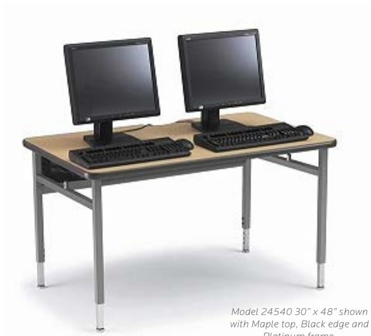
Model 24540 30" x 48" shown with Maple top, Black edge and Platinum frame.