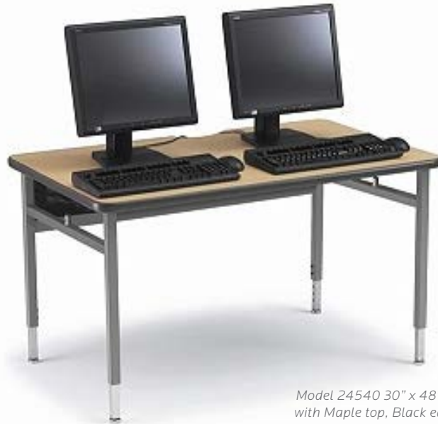
Model 24540 30" x 48" shown with Maple top, Black edge and Platinum frame.