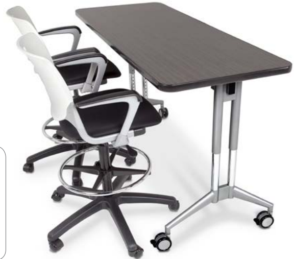
AM2460ANGRPLT Shown in Asian Night top with Charcoal edge and Platinum frame. Optional UXL Adjustable Stools.