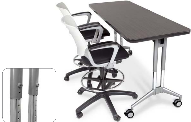
AM2460ANGRPLT Shown in Asian Night top with Charcoal edge and Platinum frame. Optional UXL Adjustable Stools.

The main frame is constructed of 2" diameter x 16-gauge round cold-rolled tubular steel that is welded to an ingenious mechanism that allows the table top to fold down and back into place easily. The substantial upper legs are made of 1.5" diameter x 14-gauge twin tube cold-rolled steel while the lower legs are constructed of chrome plated cold rolled steel. Comes with 3" dual-wheel casters for easy mobility and storage.