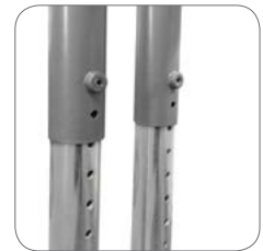
FL60HRAMEBPLT Shown in Amber Cherry top with Black edge and Platinum frame. (non-adjustable shown)