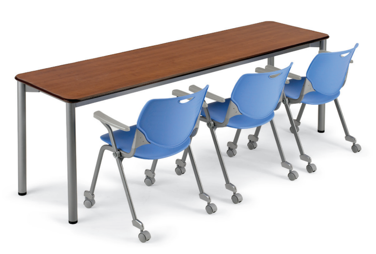
*Model XL2490 shown with optional UXL Nest & Fold Chairs, Model NF187.