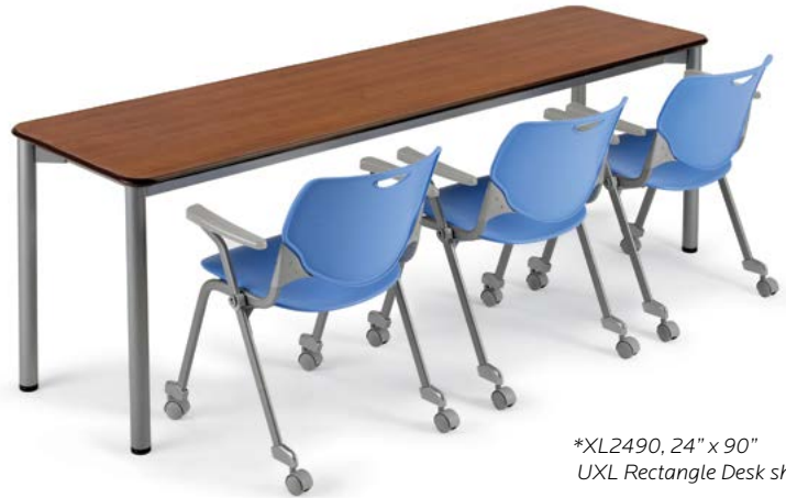
*XL2490, 24" x 90" UXL Rectangle Desk shown.

The frame is attached to the pre-drilled holes in the top with #10 x 5/8" screws. The legs then fasten into the frame at each corner. The frame comes fully assembled requiring only two bolts per leg to complete installation. The table frame is a boxed tube design made of aircraft grade aluminum to reduce weight, while being very stable and sturdy. The 16-gauge steel legs are 2" diameter and powder coated for a long lasting durable finish. Legs are available in different configurations, see chart.