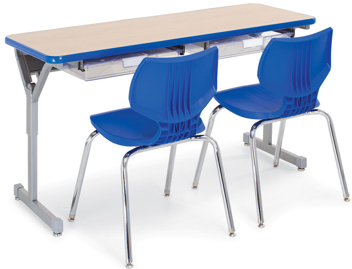
model #01361 (20"x60") shown with optional SW tote trays and 18" Flavors Stack chairs model #11849